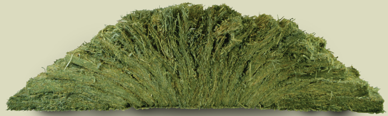
Compressed Bale Before